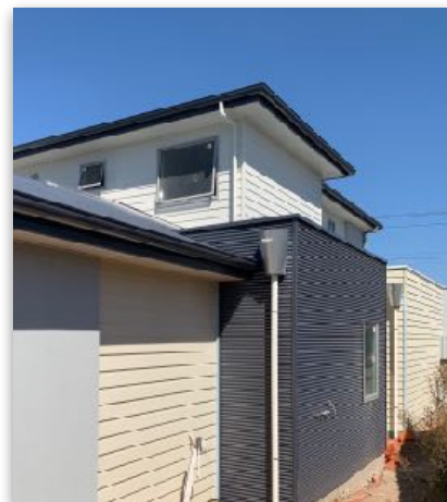
Two colours – Iron Grey and Gull Grey.

Nexsteel™ and paint partners PPG continue to collaborate to offer the construction industry more than one option.