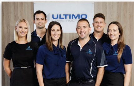
Ultimo Constructions Team