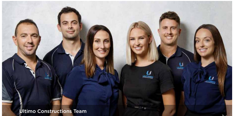
Ultimo Constructions Team