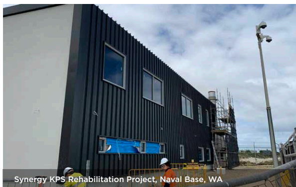
Synergy KPS Rehabilitation Project, Naval Base, WA

Nexteel™ and paint partners PPG continue to collaborate to offer the construction industry more than one option.