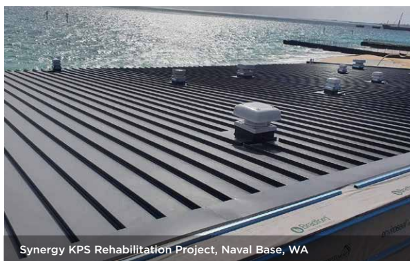
Synergy KPS Rehabilitation Project, Naval Base, WA